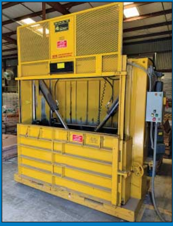
Ver-Tech GPI Model V-7240 Two-Cylinder Vertical Hydraulic Baler