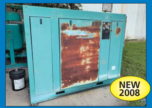
100-HP Sullivan Palatek Model 100UD Cabinet Enclosed Rotary Screw Air Compressor