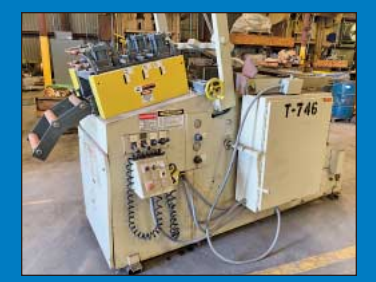
12" x Approx. 6,000 Lbs. Mfg. Unknown Cradle Straightener (Late Model)