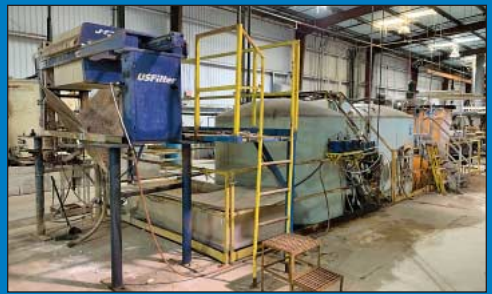
Wastewater Treatment System