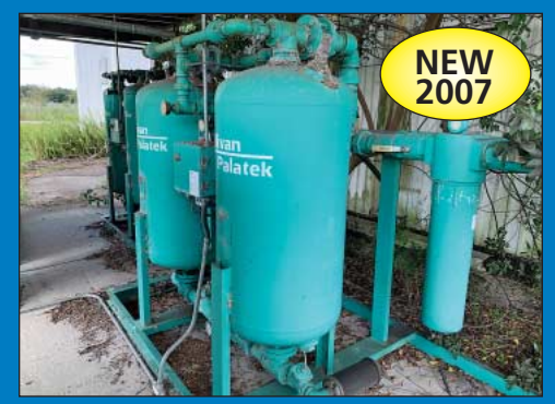
940 SCFM Sullivan Model SPS-940-116 Regenerative