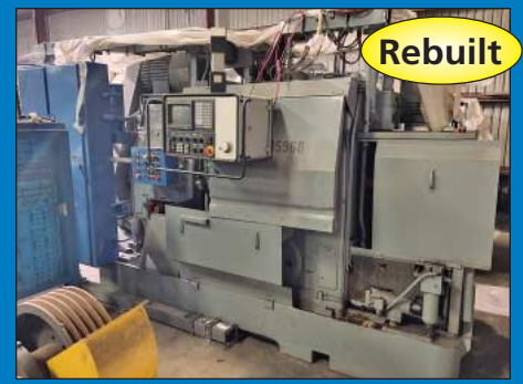
8" Acme Gridley RPA-6 CNC Chucker