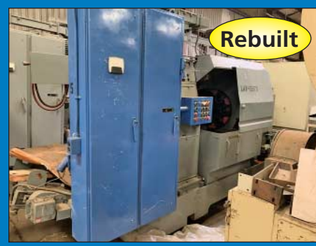
(4) 8" Acme Gridley RPA-6 Chuckers

Maintenance Machinery; Miller Deltaweld 452 Welder w/ 22A Wire Feed, Roll-In Kizzer HS1318 Mitre Horizontal Band Saw, Ridgid 300 Pipe Threader, Greenlee 1818 Mechanical Bender w/ Dies