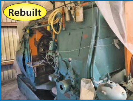
(4) 8" Acme Gridley RPA-6 Chuckers