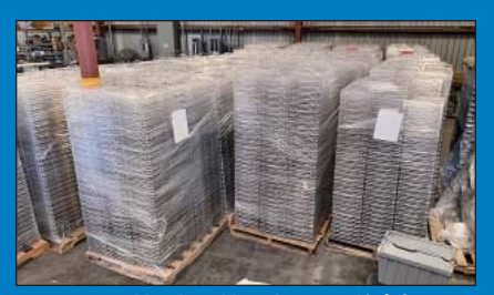
Approx. (7,500) 12" x 22" x 2" Deep Stainless-Steel Wire Parts Trays