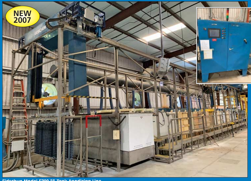
Eidschun Model E700 23-Tank Anodizing Line