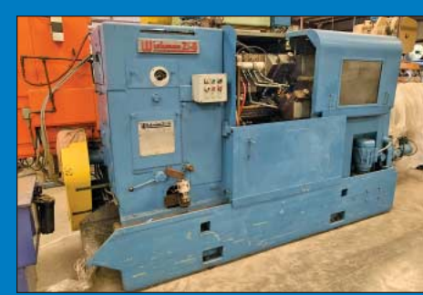
(2) 2-1/4" Wickman 2-1/4-6 Automatic Bar Machines