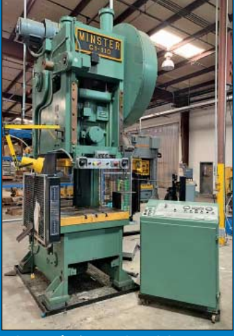
110 Ton Minster No. S1-110 Gap Frame Press

(20) 26" x 24" x 24" Two-Section Stainless Racks