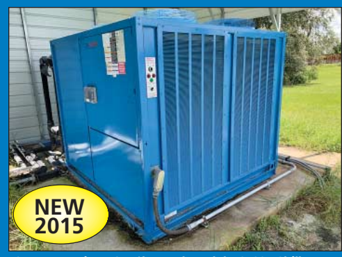
40 Ton American Geothermal Model AC4005 Chiller System