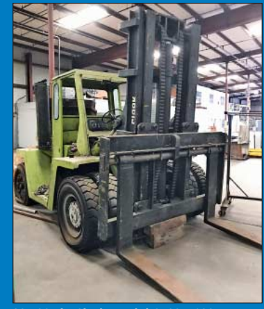
22,500 Lb. Clark Model C500-YS225DP Diesel Pneumatic Tire Lift Truck