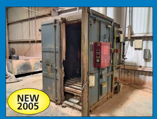
PCP Process Control Products Model PRC-196-5572 Natural Gas Burn-Off Oven