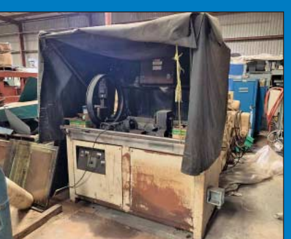
Magnaflux Model Spec-D960 Test Unit