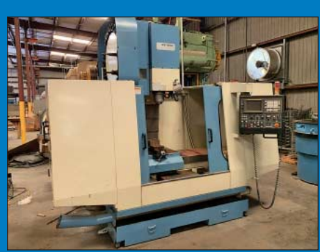
Johnford Model SV-45H CNC Vertical Machining Center