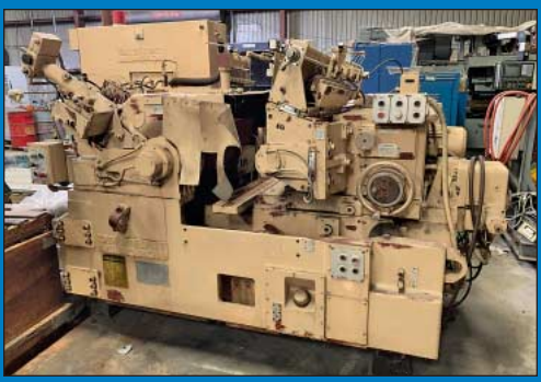
(3) Cincinnati Milacron Model 340-20 Twin-Grip Centerless Grinders