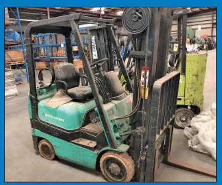
(2) 3,000 LB. Mitsubishi Model FGC15K LP Gas Lift Trucks

Large Quantity Scrap, Cast Iron Machinery, Fabricated Structural Beams