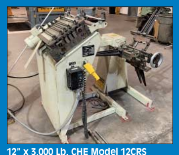
Combo Uncoiler Straightener