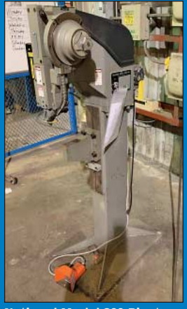
National Model 800 Riveter