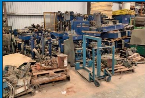
Various Conveyors, Vib Bowls, Hoppers for Automated