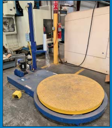
(2) Vestil Model SWA-54 Rotary Pallet Stretch Wrappers